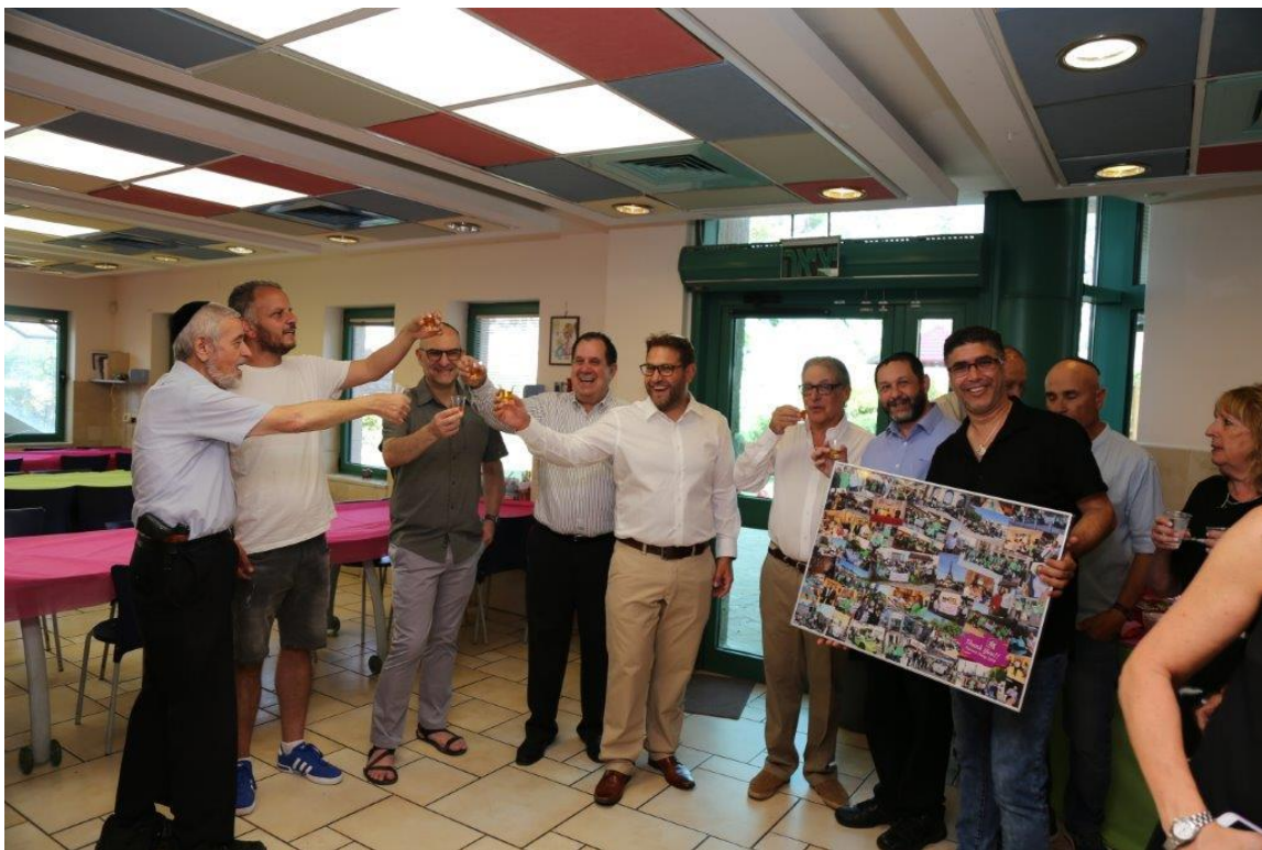
There is always time for a L'chaim ! to all !